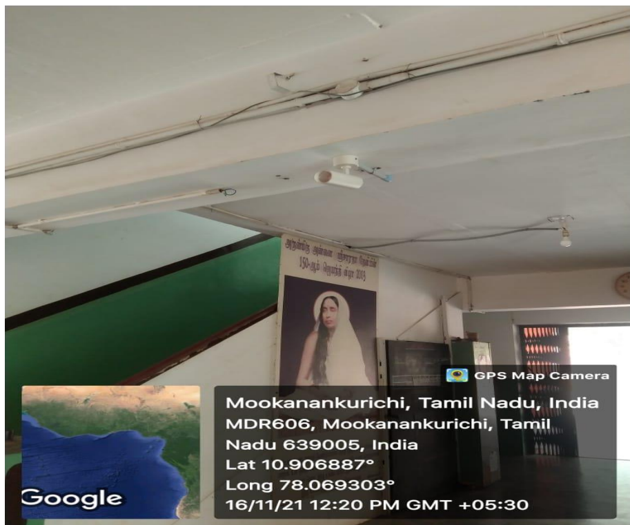
CCTV camera in prominent places