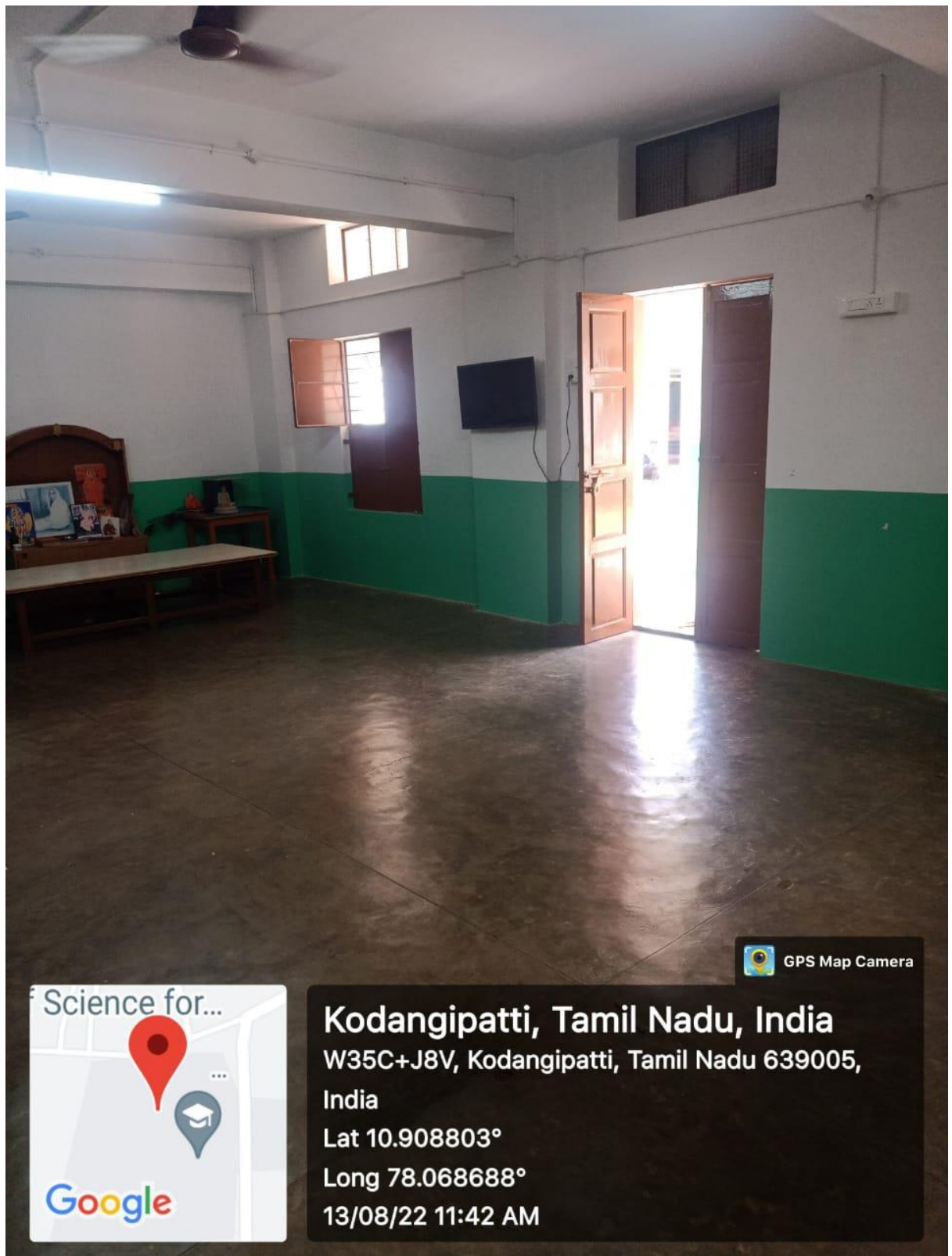
d. Day care centre for young children